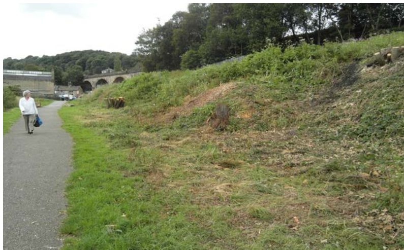
Tipside following the tree felling in July, even our meadow flowers were destroyed.

So many people we spoke to on Tipside during this period, were clearly upset by the loss of the trees that we have asked Calderdale to consider protecting the remainder under a tree preservation order, on the grounds of their importance to local amenity and wildlife. At the moment we are not having a lot of joy, but we will continue to keep the pressure on for them to do this, as we are concerned that this is going to be a continuing problem.